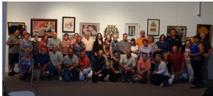
Victaulic employees enjoy a pre-show reception in the Gallery